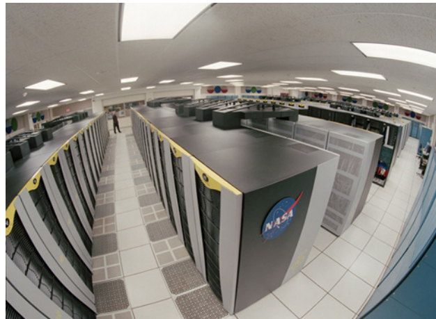
Figure 3.13 Modern Computing Power. These supercomputers at NASA's Ames Research Center are capable of tracking the motions of more than a million objects under their mutual gravitation.

However, the problem is complicated by the fact that the other stars are also moving and thus changing the effect they will have on our star. Therefore, we must simultaneously calculate the acceleration of each star produced by the combination of the gravitational attractions of all the others in order to track the motions of all of them, and hence of any one. Such complex calculations have been carried out with modern computers to track the evolution of hypothetical clusters of stars with up to a million members ( Figure 3.13 ).